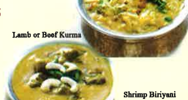
Lamb or Beef Kurma