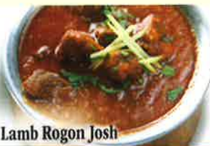
Lamb Rogon Josh