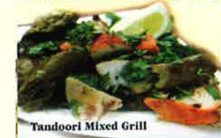
Tandoori Mixed Grill

CHICKEN TANDOORI .....12.95 spring chicken marinated in mild spices, barbecued over charcoal.