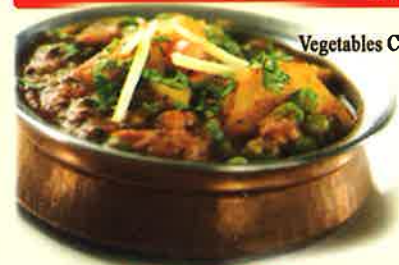
Vegetables Curry (Monday - Friday) 12:00noon-3:30pm

VEGETABLES CURRY .....7.95 choice of chana sag, mix vegetables curry or aloo motor gobi cooked with spiced flavored sauce. Served with nan or poori.